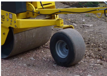
Comfortably to control Wheel set (optional)