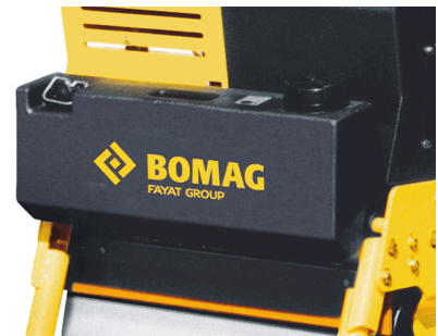
No sticking of asphalt Water spraying system with large water tank (standard)