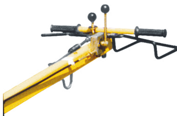
Precise and save to operate All function integrated in the steering rod head