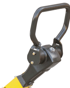
Precise and save to operate Comfortable control lever